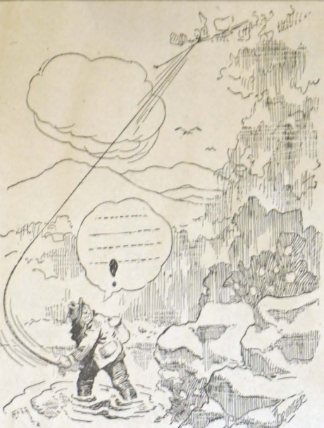
Ask Any Fisherman to Supply the Missing Language