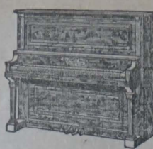
Grinnell Bros. Piano, Style 12.

Ah! What relief. No more tired feet; no more burning feet; no more aching corners, bad smelling, sweaty feet. No more pain in corns, calluses or bunions. No matter what ails your feet or what under the sun you've tried without getting relief, just use "TIZ." "TIZ" is the only remedy that draws out the poison from corns, calluses, bunions, which puff up the feet. "TIZ" is marked "TIZ" is grand. "TIZ" will cure your foot troubles as you have never before. Draw up your face and your feet will have never been so good. Get a 2-cent box at any drug store or department store, and get instant relief. Get a whole year's foot relief for only 25 cents. Think of it—Advertisement.